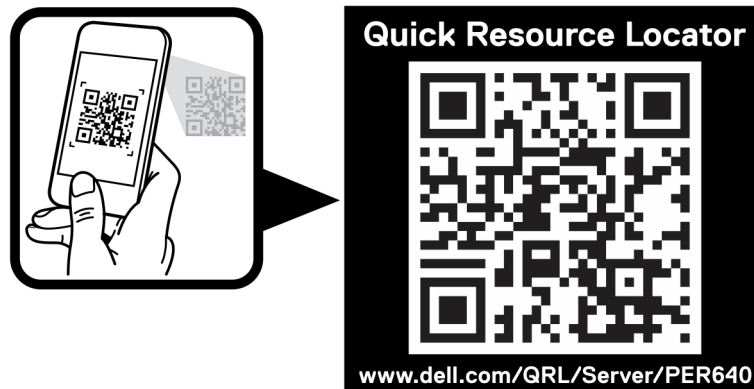
Figure 2. Quick Resource Locator for PowerEdge R640