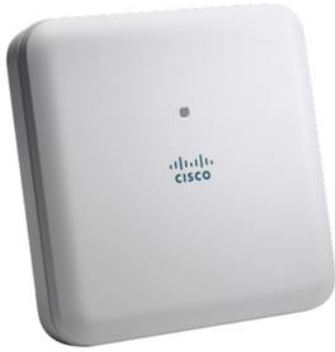
Figure 1. Cisco Aironet 1830 Series