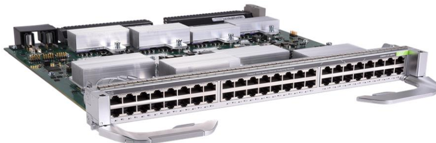
Figure 4. Cisco Catalyst 9600 48-port RJ45 Copper - 10GE/5GE/2.5GE/1GE/100Mbps/10Mbps Line Card (C9600-LC-48TX)