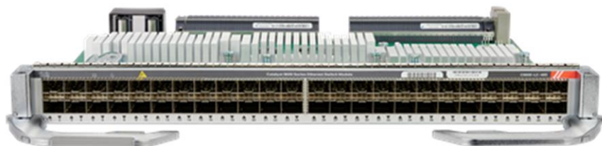
Figure 3. Cisco Catalyst 9600 Series 48-Port 1GE line card (C9600-LC-48S)